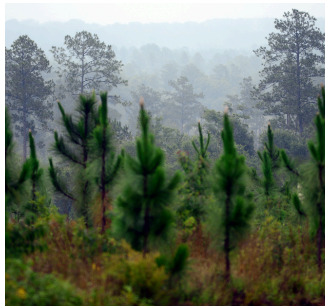
Fig. 6. Young Alabama pine forest.

Parent material (C horizon) – Just like people inherit characteristics from their parents, every soil inherits some traits from the material from which it forms. Some parent materials are transported and deposited by glaciers, wind, water, or gravity. The parent material of the Bama soil are ocean and