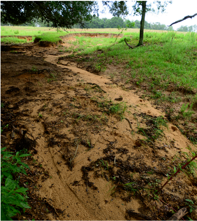
Fig. 5. Bama soil has a slight to moderate tendency to erode, especially when on a slope.