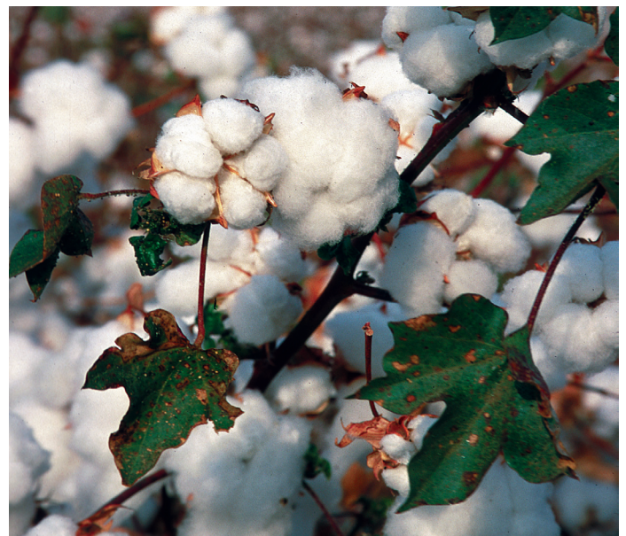
Fig.4. Cotton.

In general, soils can be used for agriculture (growing foods, raising animals, stables); engineering (roads, buildings, tunnels); ecology (wildlife habitat, wetlands), recreation (ball fields, playground, camp areas) and more. Bama soils are well suited to many uses including crop production, pasture for hay or animal grazing, forest, and most urban uses. Cotton, corn, soybean, and peanuts are the main cultivated crops ( Figure 4 ). Forests are typically made up of longleaf and loblolly pines with some oak, hickory, dogwood, and sweetgum mixed within.