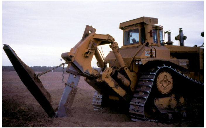
Fig. 8 Tractor with slip plow used to fracture, disrupt and modify horizons such as claypans and duripans. Credit: Kerry Arroues.

Climate – Temperature and precipitation influence the rate at which parent materials weather and dead plants and animals decompose. They affect the chemical, physical and biological relationships in the soil. California’s Mediterranean climate of cool, moist winters and dry, warm summers contributes to formation of the San Joaquin soils. The age of the San Joaquin soil is also important (see Time section). We therefore call the San Joaquin soil a relict paleosol ; that is, a soil that attained most of its relative profile development under climatic and environmental conditions of the past. Soil formation factors in the San Joaquin soil are presumed to have been cyclic and occurred in response to warming and cooling periods of two previous glacial episodes in the Sierra Nevada over about the last 100,000 years.