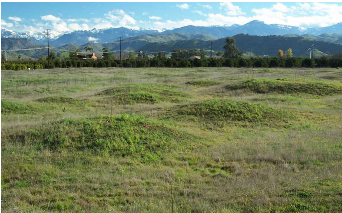
Fig. 9 Unmodified San Joaquin soil landscape with modified and leveled soils under an orange orchard. The Sierra Nevada Mountains rise as high as 4,267 meters (14,000 feet) above the San Joaquin soils.

vial alluvium from the Sierra Nevada, have also contributed to the unique origin and form of the San Joaquin soils.