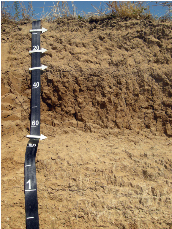
Fig. 2. Soil Profile of a San Joaquin soil illustrating horizons and horizon boundaries.