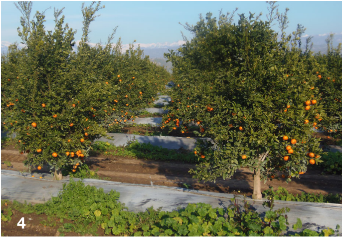
Fig. 4. Organic Tangerines growing in San Joaquin soil.