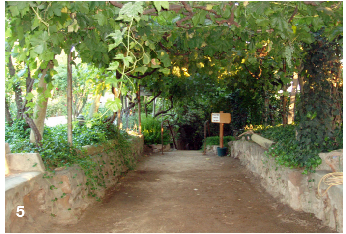
Fig. 5. Entrance down into Forestiere Underground Gardens and San Joaquin soil in Fresno, CA.