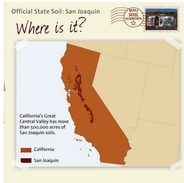
Fig. 3 San Joaquin soil series is the official state soil of California.

Typically, San Joaquin soils have a brown to reddish brown surface or surface soil horizon with a loam (a combination of sand, silt, and clay) texture that has an accumulation of organic matter . The next underlying horizon is similar in soil texture to the sur-