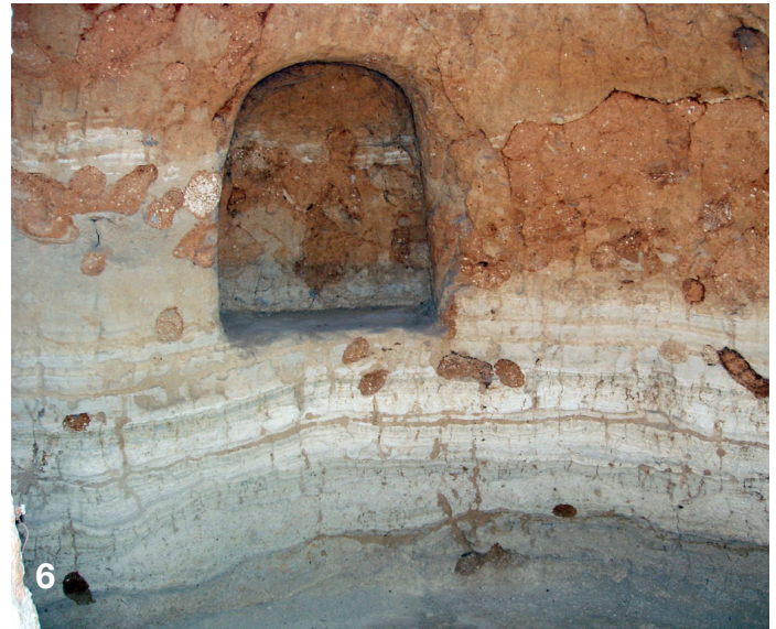
Fig. 6. Forestiere Underground Gardens room wall illustrating duripan (reddish colored) over deposits of very silty glacio-fluvial deposits from the Sierra Nevada that has elongated reddish-colored animal burrows that contain soil from above the duripan (see Organisms as a soil formation factor).