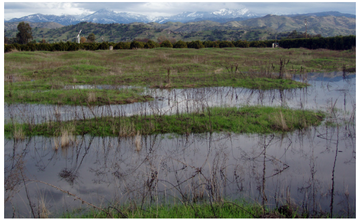
Fig. 10 Hogwallow microrelief illustrating ponding in depressions between mounds. Credit: Phil Smith, USDA-NRCS.

Flat, intensively farmed plains with long, hot, dry summers and mild winters distinguish the Central California Valley ecoregion from its neighboring ecoregions that are either hilly or mountainous, covered with forest or shrub, and generally non-agricultural. Ecoregion 7 ( Figure 11 ) includes the flat valley basins of deep sediments adjacent to the Sacramento and San Joaquin Rivers, as well as the fans and terraces around the edge of the valley. The two major rivers flow from opposite ends of the Central California Valley, entering into the Sacramento–San Joaquin River Delta and San Pablo Bay. The region once contained extensive prairies, oak savannas, desert grasslands in the south, riparian woodlands, freshwater marshes, and vernal pools . More than one-half of the region is now in cropland, about three-fourths of which is irrigated. Environmental concerns in the region include salinity, ground water overdraft, and subsidence, loss of wildlife and flora habitats, and urban sprawl.