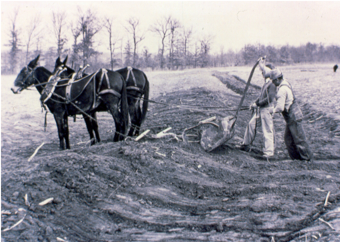
Fig. 7 Fresno Scraper was utilized to assist movement of large amounts of soil efficiently when leveling the natural microrelief of the landscape.

Modification of the soil accomplished the intended purpose by increasing the root zone and water infiltration into the soil. It also permanently disrupted the natural ecology of these areas by changing the hydrology and ponding characteristics and the sequence and continuity of soil horizons permanently. This is an excellent example of the affect that organisms (humans) can have on soil formation. In recent decades it has been recognized that natural, relatively unmodified environments with unique features have value and can be preserved in some areas. These preserves and conservancies have allowed future generations to see what past landscapes of San Joaquin soil looked like before they were modified.