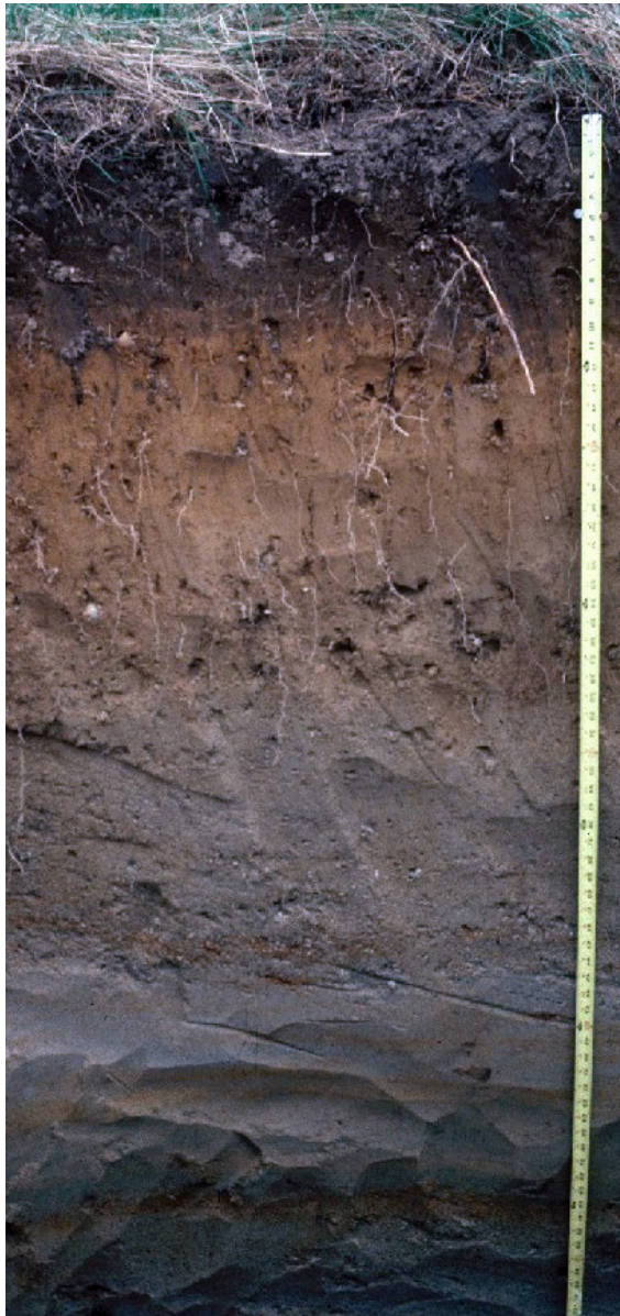
Fig. 1. Soil profile of a Windsor soil from Hartford County, CT.