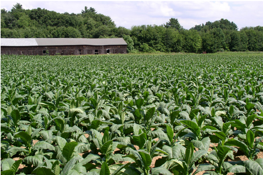
Fig. 3 . Tobacco grown on Windsor loamy sand. The tobacco shed in the background is a long, low windowless building with a pitched roof which uses ventilation to aid the curing of the tobacco.