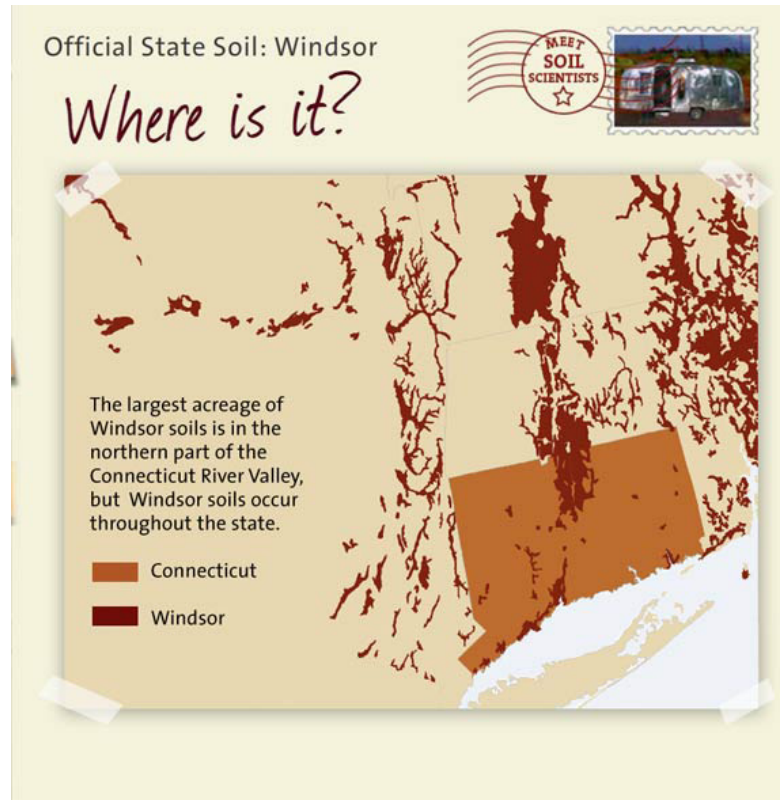
Fig. 2. Distribution of Windsor soil series.

In all, there are a total of 112 named soil series in Connecticut. Each soil series has specific relationships to landscapes, regional