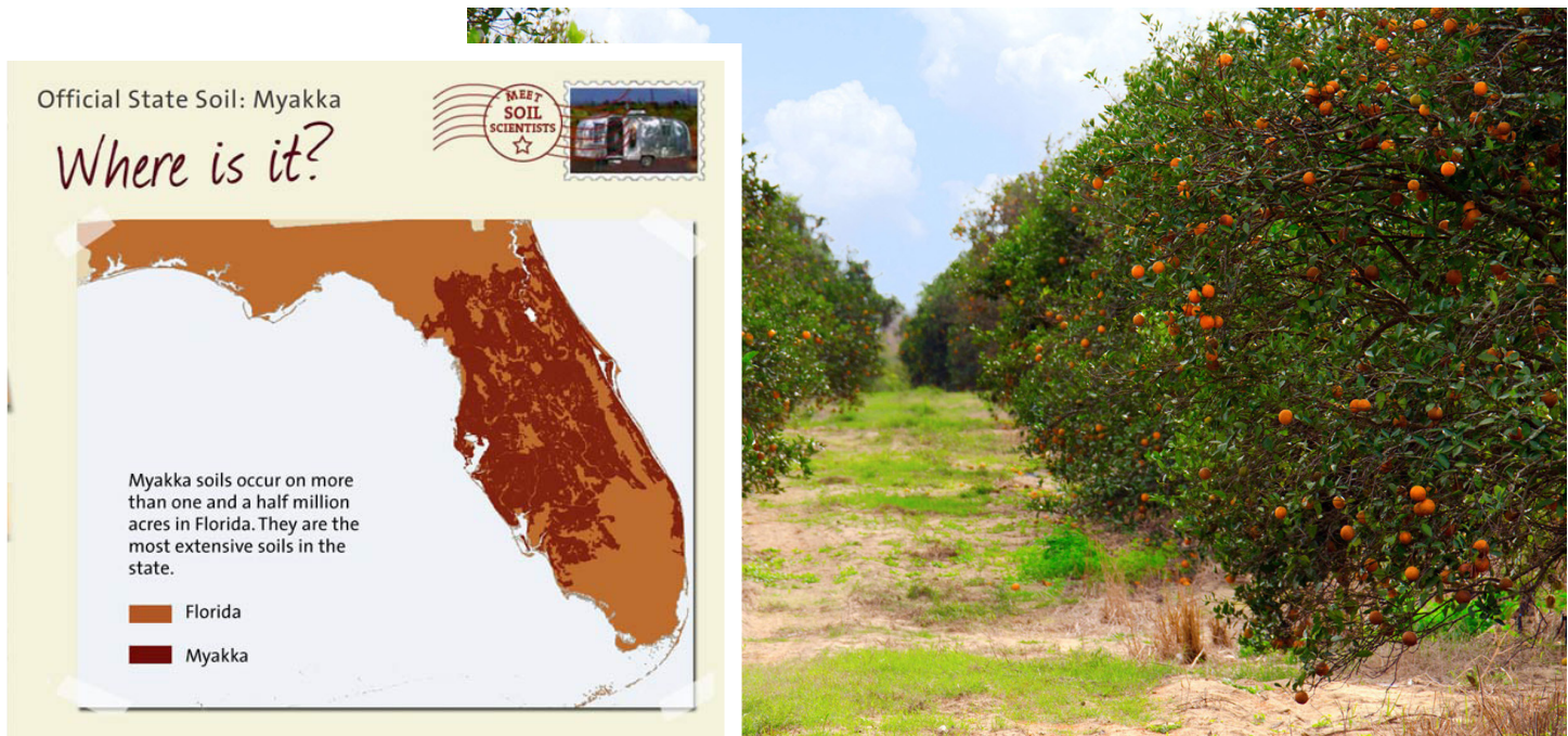
Fig. 2. (Above) Location of Myakka Soil in Florida.