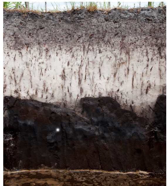
Fig. 1: Soil profile of a Myakka soil.

At the surface of Myakka ( Figure 1 ) is the A horizon- it is black in color and can be 15 cm thick (6 in). As you dig deeper, the next layer of soil, the E horizon, goes from 15 to 51 cm (6 – 20 in). This horizon is a very pale brown although it may have streaks of many other colors, especially where old roots have died. This sandy horizon may be acidic and some of the things that were once found in it have been washed down to the next horizon. This next layer, the B horizon, goes from 51 to 91 cm (20-36 in). It can be black to dark reddish brown, strongly acidic, and sandy. From 91 to 142 cm (36-56 in) is an in between horizon, the C/B. It has characteristics of both the C and B horizons. It is brown with dark reddish brown spots. Finally, if you dig deeper than 142 cm (56 in), you will find the C