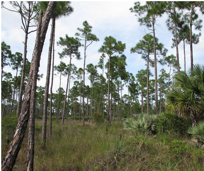
Fig. 4. The Myakka soils support most of Florida's pine flatwoods.