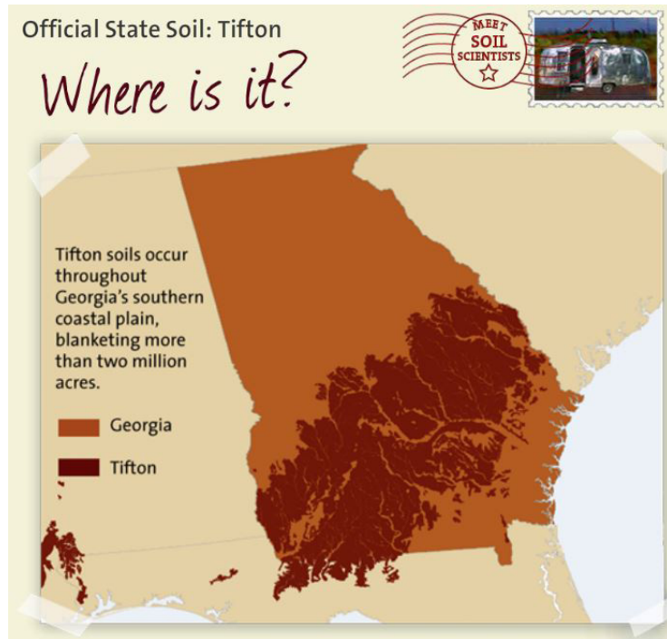
Fig. 3. Location of the Tifton soil series in Georgia, Florida, and Alabama.