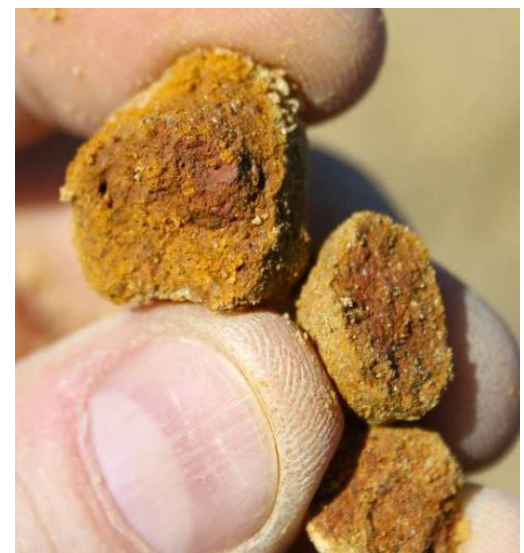
Fig. 1. Broken face of a plinthite nodule.

Every soil can be separated into three separate size fractions called sand , silt , and clay , which makes up the soil texture . They are present in all soils in different proportions and say a lot about the character of the soil. Tifton soils generally have sand or loamy sand surface horizon textures underlain by sandy loam or sandy clay loam subsoil texture ( Figure 2 ). Ironstone nodules usually occur in the surface horizons and upper subsoil, and plinthite generally occurs in the lower subsoil.