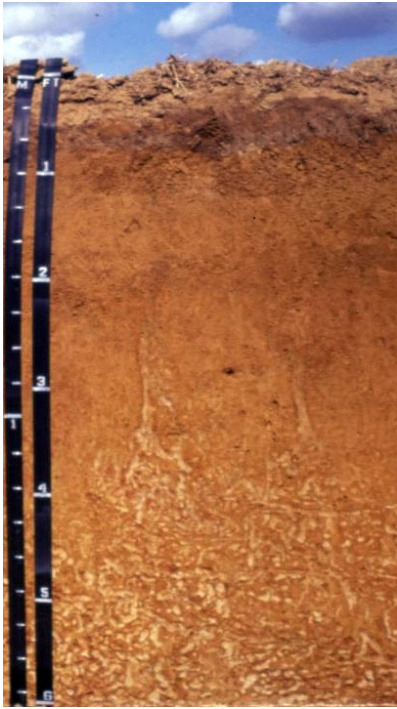
Fig. 2 Profile of the Tifton soil series. Left tape in meters, right tape in feet.