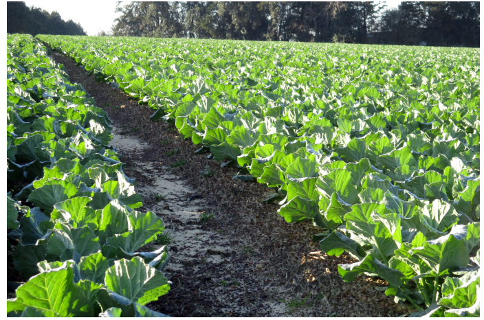
Fig. 6. Collards are a winter vegetable crop grown on Tifton soil. Ironstone nodules are evident between crop rows.