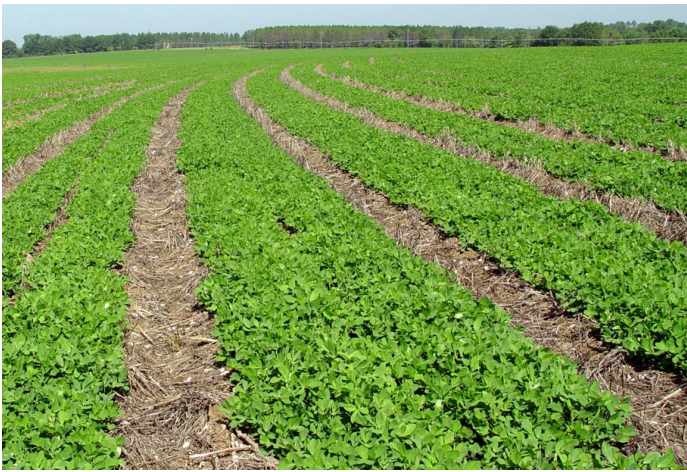
Fig. 5 Strip till peanuts on Tifton soil. Much of the Tifton soils in Georgia are planted in crops.