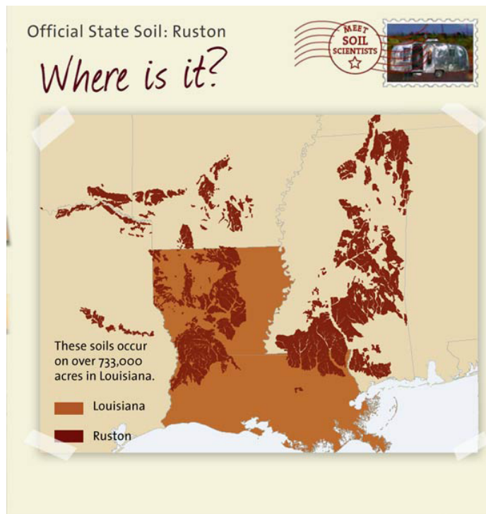
Fig. 2. Location of the Ruston soil series in Louisiana, and surrounding states.

Forestry is the #1 agriculture industry in Louisiana (13.9 million acres of forests). The Ruston soil has low fertility and moderately high levels of exchangeable aluminum within the rooting zone that are potentially toxic to some agricultural crops but ideal for the production of southern pines such as loblolly, slash, and long-leaf pine. Ruston soils are used mainly for woodland production consisting of southern pine and other hardwoods with understories of shrubs or grasses ( Figure 3 ). Some areas of understory vegetation are managed as range, which provides grazing for