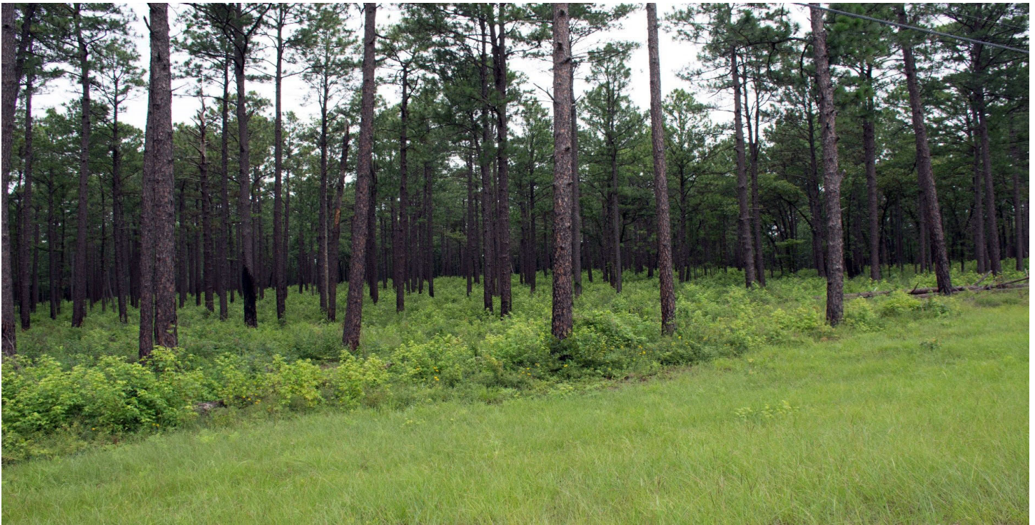
Fig. 3 A stand of longleaf pine with understories of shrubs or grasses.

Ruston soils are low in organic matter and have high levels of exchangeable aluminum but are productive with added fertilizer and lime. Since these are sandy clay loam soils, added fertilizer and lime can easily leach from the soils causing nutrients to enter natural waterways. The soil has a seasonal high water table at a depth of 184 cm or greater (6 feet) below the surface. The natural low fertility and high exchangeable aluminum of this soil is the main limitation for crops other than woodlands, but using minimum tillage and returning all crop residue to the soil or regularly adding organic matter can help to improve fertility, maintain tilth and organic matter content, and reduce runoff.