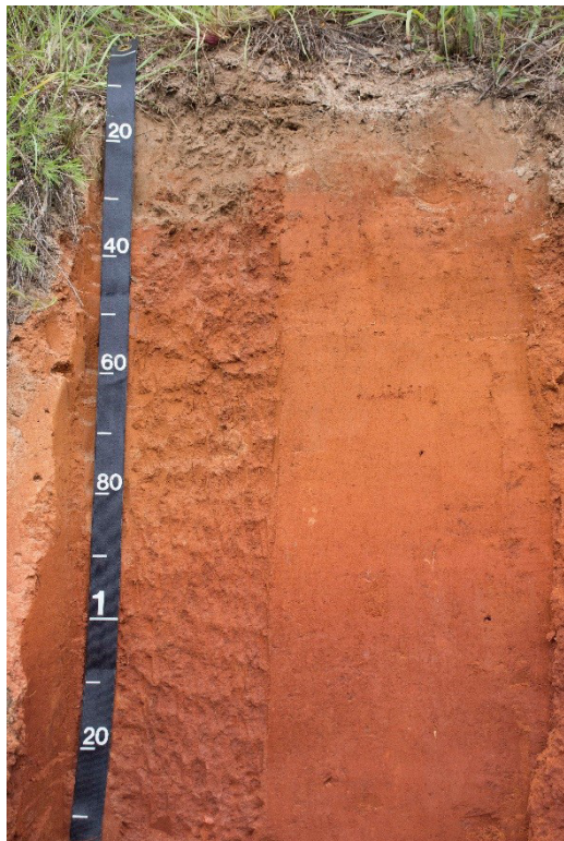
Fig. 1 A 13-cm topsoil of dark grayish brown fine sandy loam and a 15-cm subsurface of pale brown fine sandy loam; a subsoil of red clay loam in the upper part, yellowish red fine sandy loam in the middle part, and red sandy clay loam in the lower part.