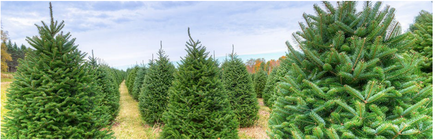
Fig. 3. Kalkaska soils have favorable conditions for growing Christmas trees.