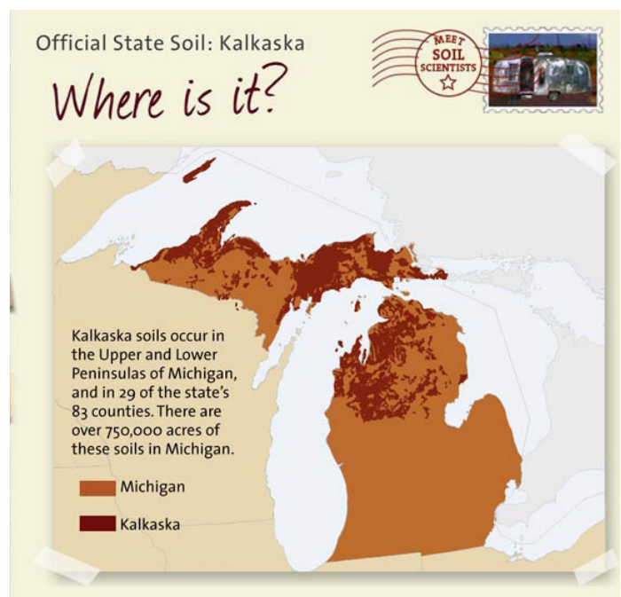
Fig. 2. Distribution of Kalkaska soil in Michigan. Credit: Smithsonian Institution Forces of Change.

The rapid permeability of the Kalkaska soil can cause the soil to be droughty at times. Seedling mortality is a major concern. Planting when the soil is moist or planting trees that can withstand dry conditions helps reduce the seedling mortality rate. In logging areas, loose sand can interfere with the traction wheeled equipment, especially during dry periods. Crop production on the Kalkaska soil typically requires irrigation.