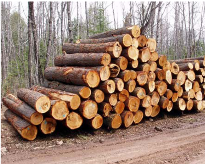
Fig. 4. Kalkaska soil produces excellent stands of northern hardwoods. Timber harvest and processing is the leading industry in northern Lower Michigan and the Upper Peninsula where Kalkaska occurs.