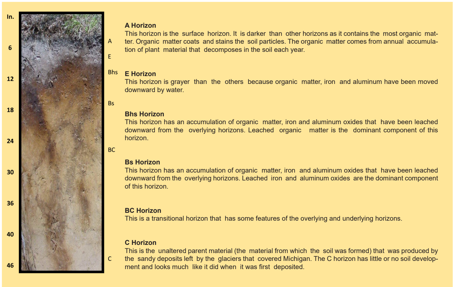
Fig. 1. Soil profile of Kalkaska soil formed in sandy glacial deposits.