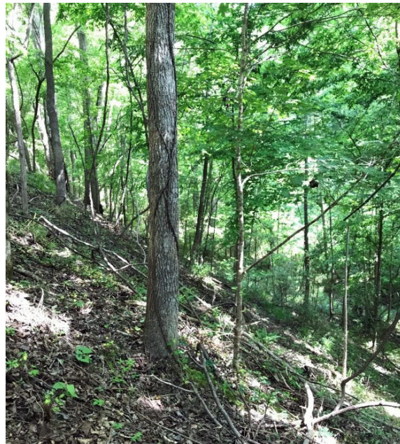
Fig. 3. (Above left) Forest landscape setting of Natchez silt loam in a steep wooded area of the Mississippi silty uplands.