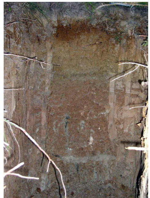
Fig. 1: Natchez soil profile.

Every soil can be separated into three separate size fractions called sand, silt, and clay, which make up the soil texture . They are present in all soils in different proportions and say a lot about the character of the soil. The Natchez is formed in thick loess accumulations that are high in silt and low in sand. The soil feels silty to touch, is moderately permeable to water, and runoff is very rapid. Soil texture in the topsoil and the subsoil is silt or silt loam but may have small shell fragments in the lower horizons .