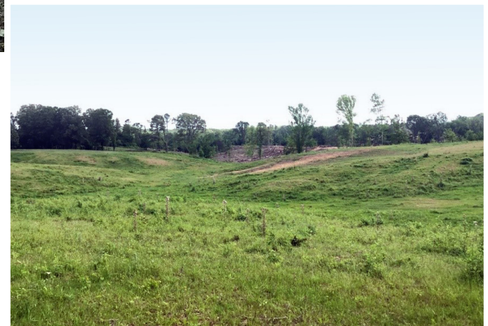
Fig. 4. Natchez soil is part of the Sunken Trace, located near Port Gibson, MS.