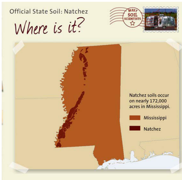
Fig 2. (Above) Natchez soil series can be found from the north to south of the state covering about 19 counties.