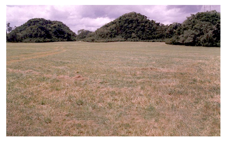
Fig. 2 Landscape of Bayamón soil in northern Puerto Rico (note the haystacks).

series is usually more than 200 cm (80 inches) deep and very strongly acid throughout (pH < 5.0). The topsoil (also called A horizon, the layer of soil that we plow or plant seeds in) has a dark reddish-brown color, generally less than 2% organic matter, and can be as much as 20 cm (8 inches) thick (Figure 1). The red color gets brighter in the subsoil (or B horizon) as the organic matter decreases with depth.