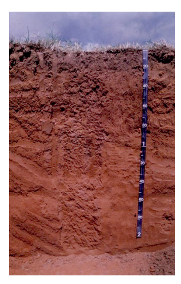
Fig. 1 Bayamón soil profile.

Bayamón soils are found on 2 to 12 percent slopes on uplands, coastal plains and valleys intermingled among limestone hills (haystacks) ( Figure 2 ) and sinkholes in the karst region of the northern part of the island. This