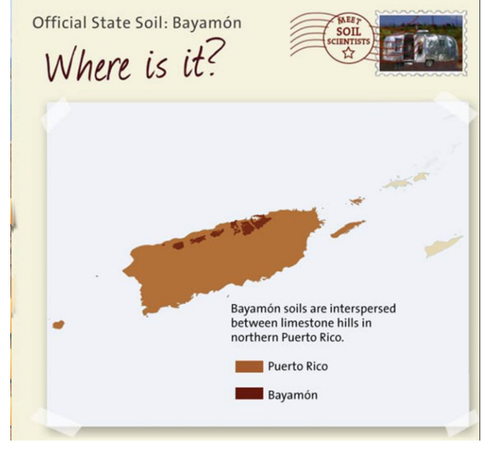
Fig. 3 Location of Bayamon in Puerto Rico. Credit: Smithsonian Institution's Forces of Change. https://forces.si.edu/soils/interactive/statesoils/html/index.html