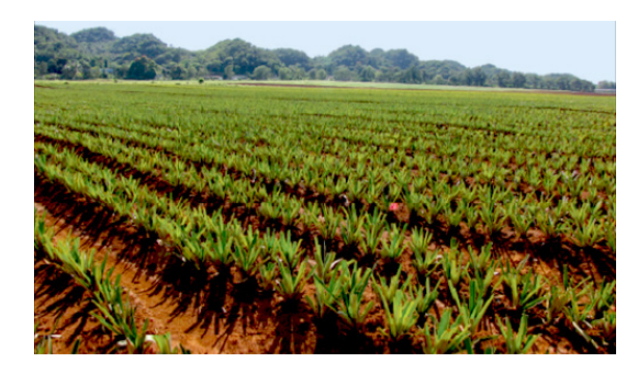
Fig. 4 Pineapple field in Bayamón soil.

Yes, you can dig a soil. It is called a soil pit and it shows you the soil profile . The different horizontal layers of the soil are called soil horizons. If you want to dig a Bayamón soil pit, you will have to travel to the northern coastal plains of Puerto Rico where it can be found on more than 9,300 hectares (23,300 acres) ( Figure 3 ). This does not mean other types of soil cannot be found there, but the Bayamón is among the most common. There are more than 200 named soil series mapped in Puerto Rico.