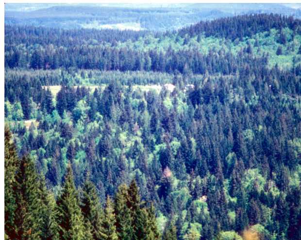
Fig. 3. Mixed conifer forest growing on Tokul soils.

In general, soils can be used for agriculture (growing foods, raising animals, stables); engineering (roads, buildings, tunnels); ecology (wildlife habitat, wetlands), recreation (ball fields, playground, camp areas) and more. Tokul soils are on the western side of the Cascade Mountains along the Puget Trough, from south of Seattle north to the Canadian border. There are many crops that are grown from this soil: berries, leafy greens, row crops, livestock, and ornamental flowers and shrubs used for landscaping (Figure 4).