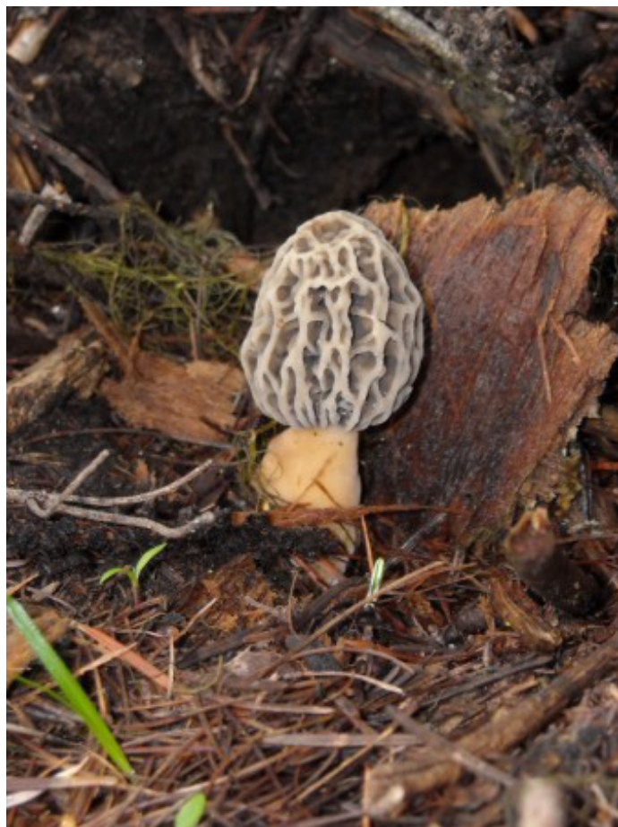
Fig. 5. Morel mushroom on National Forest System lands.

Parent material (C horizon) – Just like people inherit characteristics from their parents, every soil inherits some traits from the material from which it forms. Some parent materials are transported and deposited by glaciers, wind, water, or gravity. Tokul soils parent material is volcanic ash and loess deposited over glacial till. The glacial till parent material was transported to the Puget Sound region by the Cordilleran Ice Sheet ~9500 years ago. The volcanic ash is comprised of various eruption events that occurred after the retreat of the Cordilleran Ice Sheet.