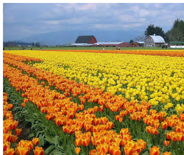
Fig. 4. Field of ornamental tulips growing on Tokul soil in western Washington.